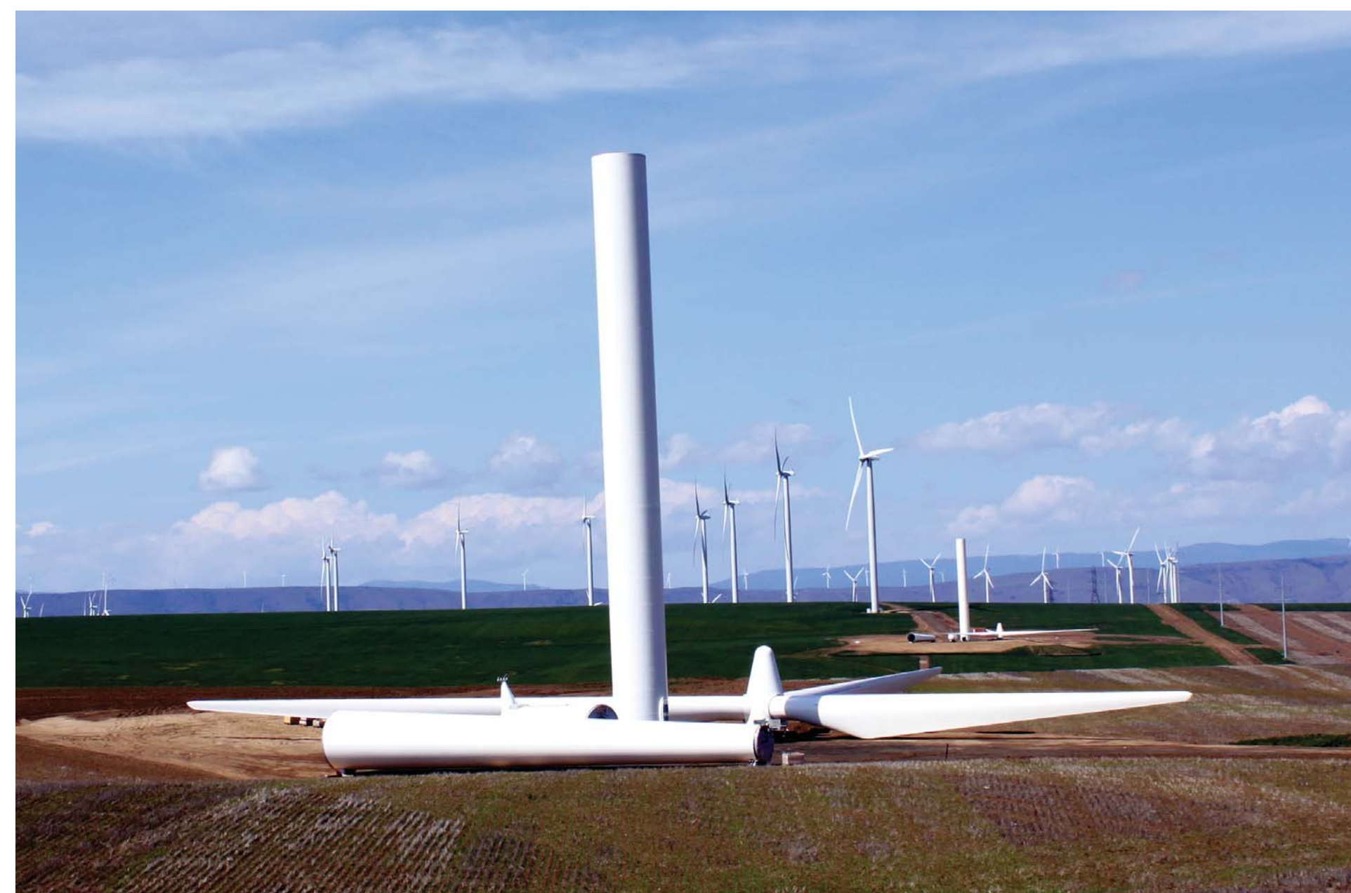
The Biglow Canyon Wind Farm under construction. Located in Oregon, at 450 MW of installed capacity it is over 280x larger than our proposed project.

As fuel costs and concerns over carbon emissions rise, many countries are now encouraging the deployment of wind power at a massive scale. With the UK, US, India, Australia, and China all investing heavily, wind power is the fastest growing method of electrical generation in the world.