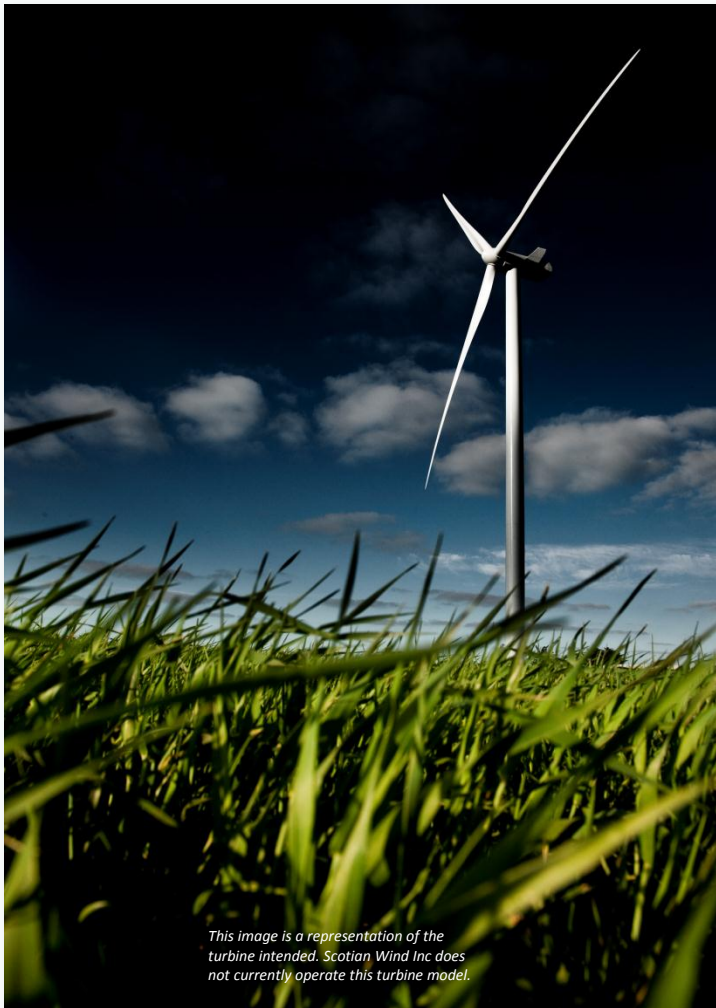
This image is a representation of the turbine intended. Scotian Wind Inc does not currently operate this turbine model.

With new technologies and innovative design, modern wind turbines are devised to minimize noise and impacts on wildlife.