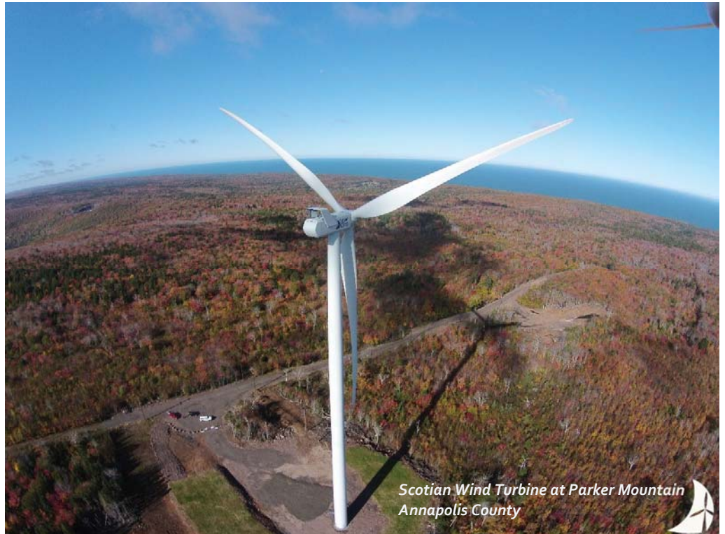
Scotian Wind Turbine at Parker Mountain Annapolis County

The administration of these funds will be handled locally by local community groups and residents. The community will decide how to distribute the funds through a committee drawn from local stakeholders and organizations. The kinds of projects that could receive funds include: