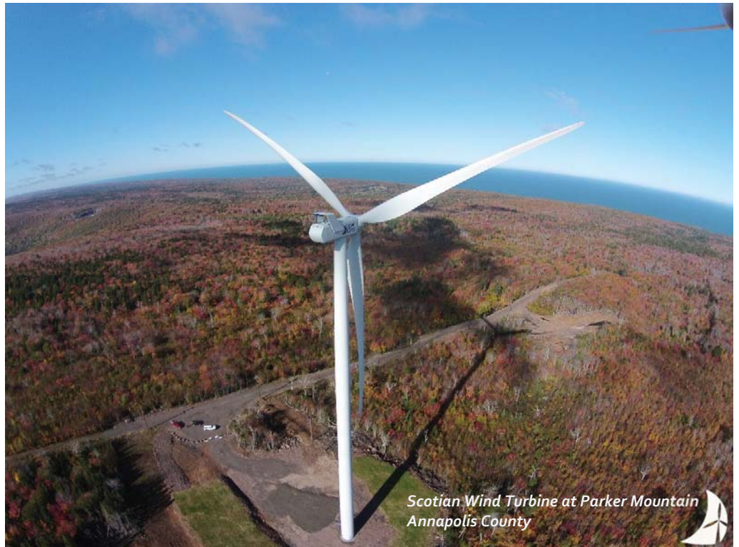
Scotian Wind Turbine at Parker Mountain Annapolis County

The administration of these funds will be handled locally by local community groups and residents. The community will decide how to distribute the funds through a committee drawn from local stakeholders and organizations. The kinds of projects that could receive funds include: