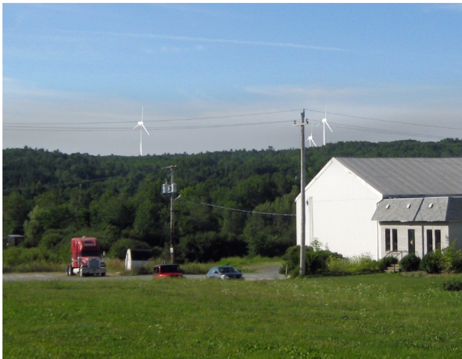
The project computer model view from J.W. Mason Property.

Strum Environmental have completed phase one of the Environment Assessment for the project. The community is welcome to comment and provide their input through our meeting on February 13 or directly through the government web site at: http://www.gov.ns.ca/nse/ea/martock-ridge.asp